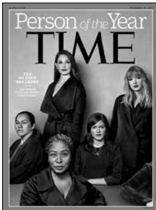
Dec. 18, 2017