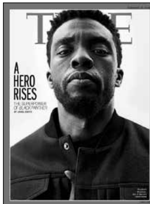
Feb. 19, 2018