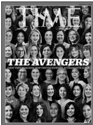
Jan. 29, 2018