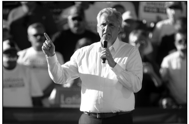
House Minority Leader Kevin McCarthy speaking with supporters of Donald Trump at a "Make America Great Again" campaign rally at Phoenix Goodyear Airport in Goodyear, Arizona, Oct. 28, 2020.

DO NOT TURN THIS PAGE UNTIL YOU ARE INSTRUCTED TO DO SO!