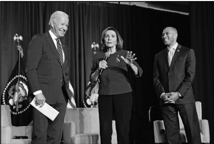
President Joe Biden, joined by Speaker Nancy Pelosi (D-Calif.) and Chairman of the House Democratic Caucus Hakeem Jeffries (D-N.Y.), participates in a Q&A at the House Democratic Caucus Issues Conference, Friday, March 11, 2022, at the Hilton Philadelphia Penn's Landing in Philadelphia.