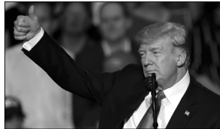
U.S. President Donald Trump speaks with supporters at a Make America Great Again campaign rally at International Air Response Hangar at Phoenix-Mesa Gateway Airport in Mesa, Arizona.

DO NOT TURN THIS PAGE UNTIL YOU ARE INSTRUCTED TO DO SO!