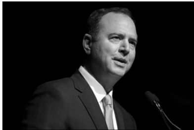
U.S. Congressman Adam Schiff speaks with attendees at the 2019 California Democratic Party State Convention at the George R. Moscone Convention Center in San Francisco.