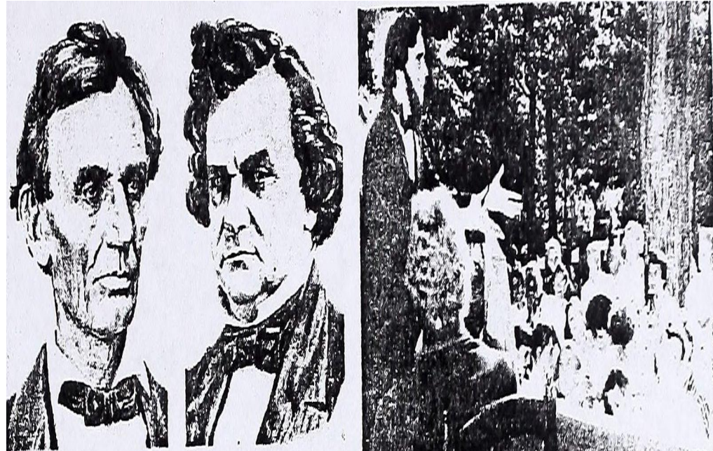
ABRAHAM LINCOLN STEPHEN A. DOUGLAS