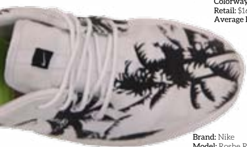
Brand: Nike Model: Roshe Runs Colorway: Palm Trees Retail: $129 Average Resale: $170