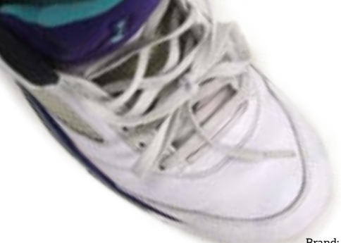
Brand: Air Jordan Model: Retro 5 Colorway: Grapes Retail: $160 Average Resale: $221