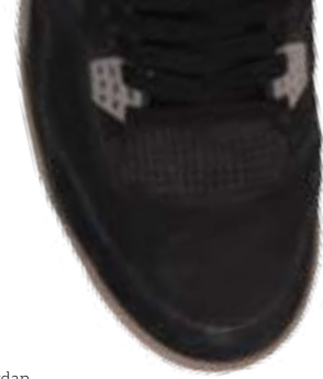
Brand: Air Jordan Model: Retro 4 Colorway: Breds Retail: $160 Average Resale: $318