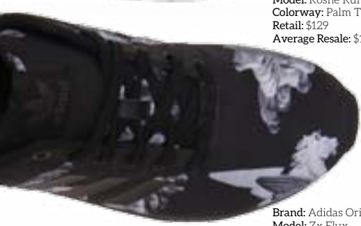
Brand: Adidas Originals Model: Zx Flux Colorway: Mythology Retail: $80 Average Resale: $170