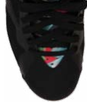
Brand: Air Jordan Model: Retro 7 Colorway: Barcelona Nights Retail: $190 Average Resale: $246