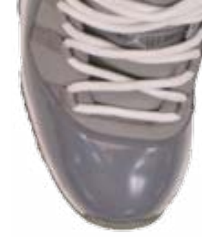
Brand: Air Jordan Model: Retro 11 Colorway: Cool Greys Retail: $175 Average Resale: $329