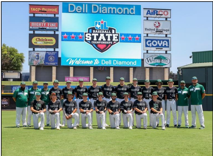
Conference 3A – Franklin