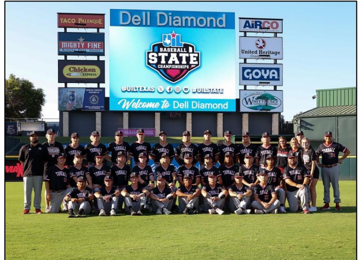
Conference 6A – Tomball