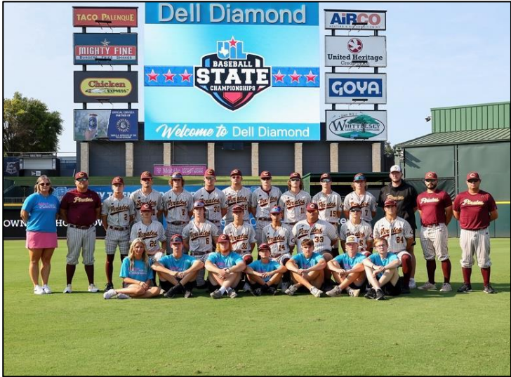
Conference 2A – Collinsville