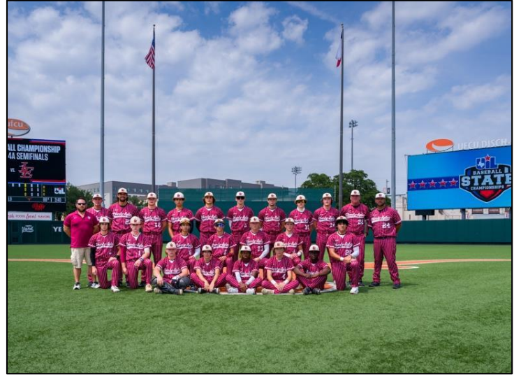
Conference 4A –Liberty-Eylau