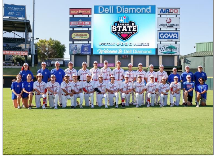
Conference 5A – Grapevine