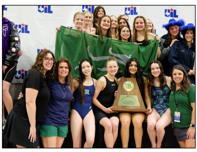
Girls | Conference 5A – Frisco Reedy