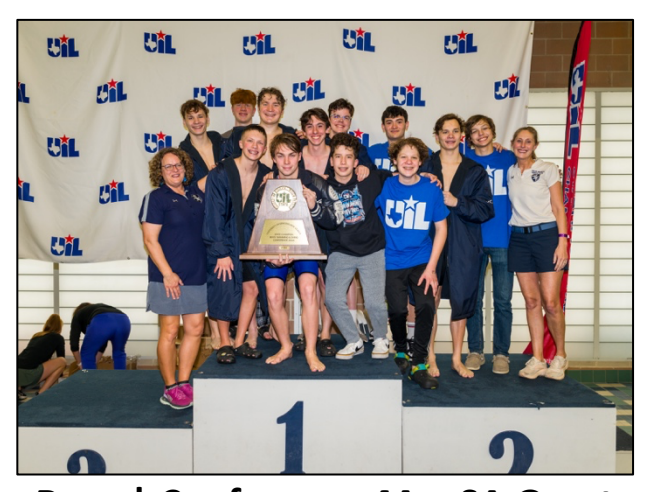
Boys | Conference 4A – SA Great Hearts Monte Vista