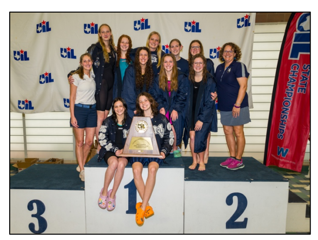
Girls | Conference 4A – SA Great Hearts Monte Vista