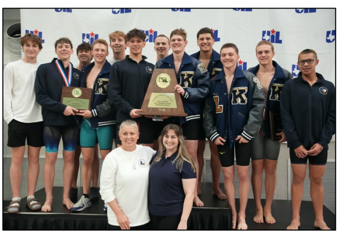
Boys | Conference 6A – Keller